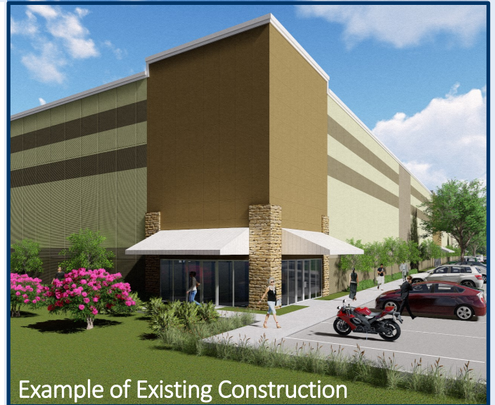
Example of Existing Construction