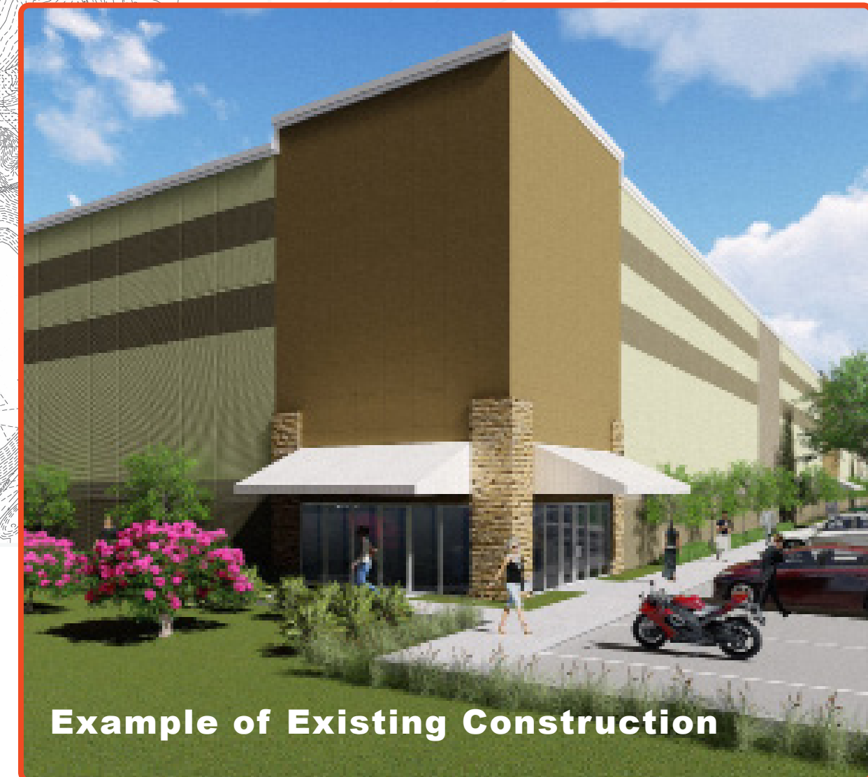
Example of Existing Construction

Able to accommodate 100,000 - 450,000 square feet