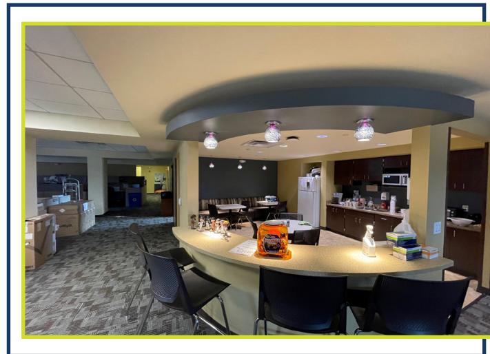
On-site cafe located on 4th floor

For more information or to schedule a tour please contact: