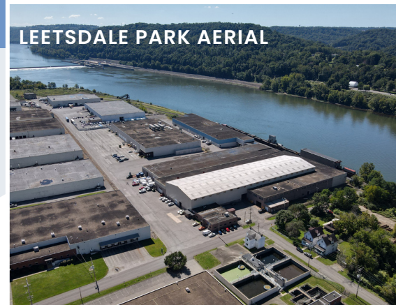
LEETSDALE PARK AERIAL

Buncher Commerce Park – Leetsdale is one of Western Pennsylvania's first large scale industrial parks, featuring quality construction. The park has readily available space for distribution, flex, technology & light manufacturing applications. Excellent location on Route 65 with 10 minute access to I-79.